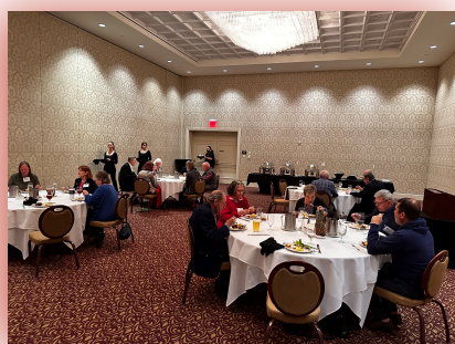
L - Department members enjoying lunch together on Thursday.