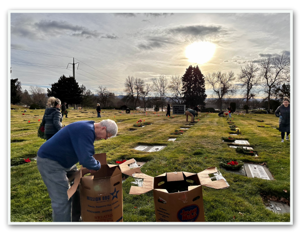
Blue Mountain Memorial Gardens