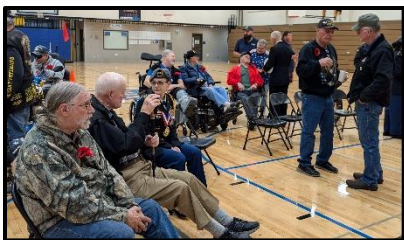
Local Veterans from all Branches