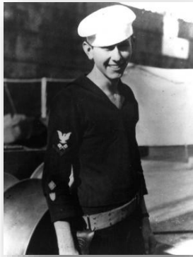
Signalman 1st Class Douglas A. Munro