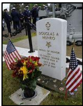
Douglas A. Munro

For his sacrifice, Douglas Munro posthumously received the Medal of Honor, our nation's highest military award – an award Puller nominated Munro for. The Coast Guard has honored Munro's legacy throughout the past 75-plus years.